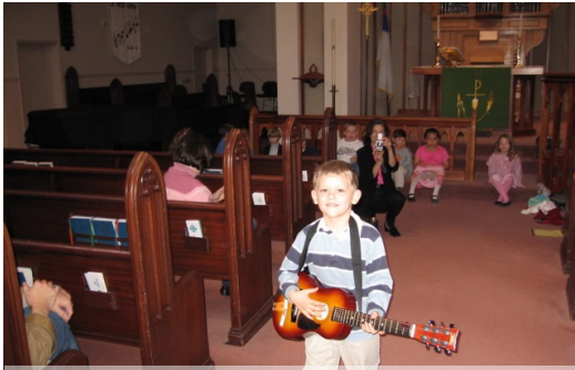
Jesus Loves Me