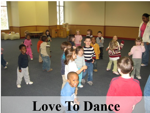
Love To Dance